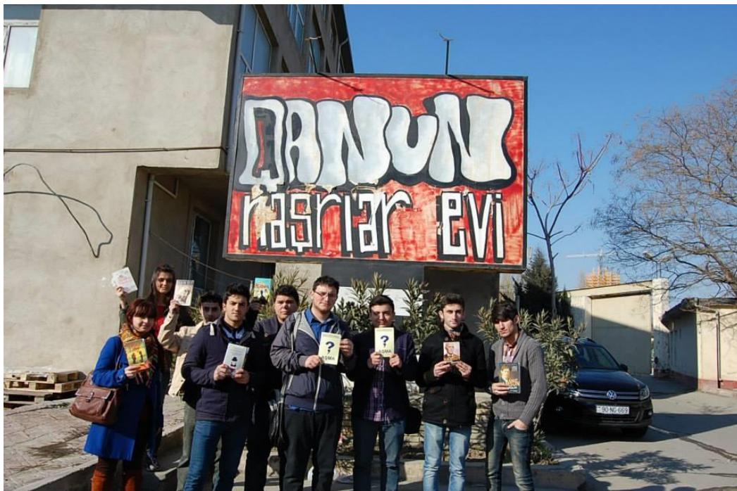
Support flashmob to "Qanun".

In February 2013, several Members of Parliament criticized Aylisli during a parliamentary session and called for revocation of his honorary title of “People’s Writer,” as well as other awards that had been granted to Aylisli during his long and