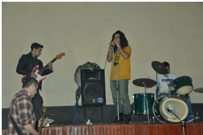
"Tengri" rock group.

In addition to individual performers, bands whose music or genres are considered to be