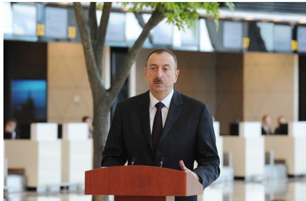
Ilham Aliyev, President of Azerbaijan.

As outlined in the previous chapter, Azerbaijan is bound by international law to ensure respect for and protection of the right to freedom of expression, including the right to artistic freedom of expression. Stemming from its international commitments, the Azerbaijani Constitution and domestic law contain many provisions guaranteeing the right to freedom of expression for all citizens.