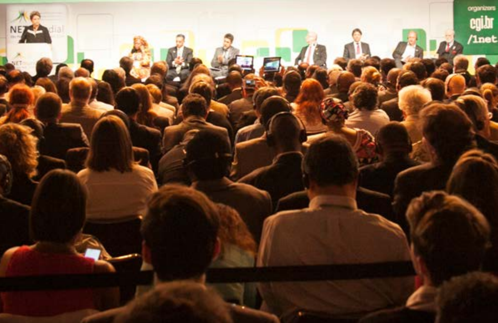
President Dilma Rousseff speaking at the opening ceremony of NETmundial, 23 April 2014