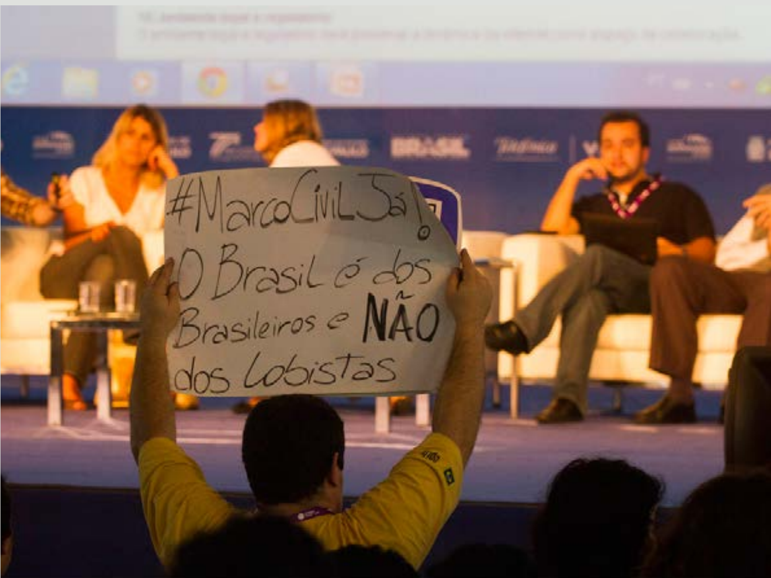
Protest during a forum on Marco Civil da Internet - Campus Party Brasil 2013, 30 January 2013. The sign reads: “#MarcoCivilNow! Brazil belongs to its people, not to lobbyists”