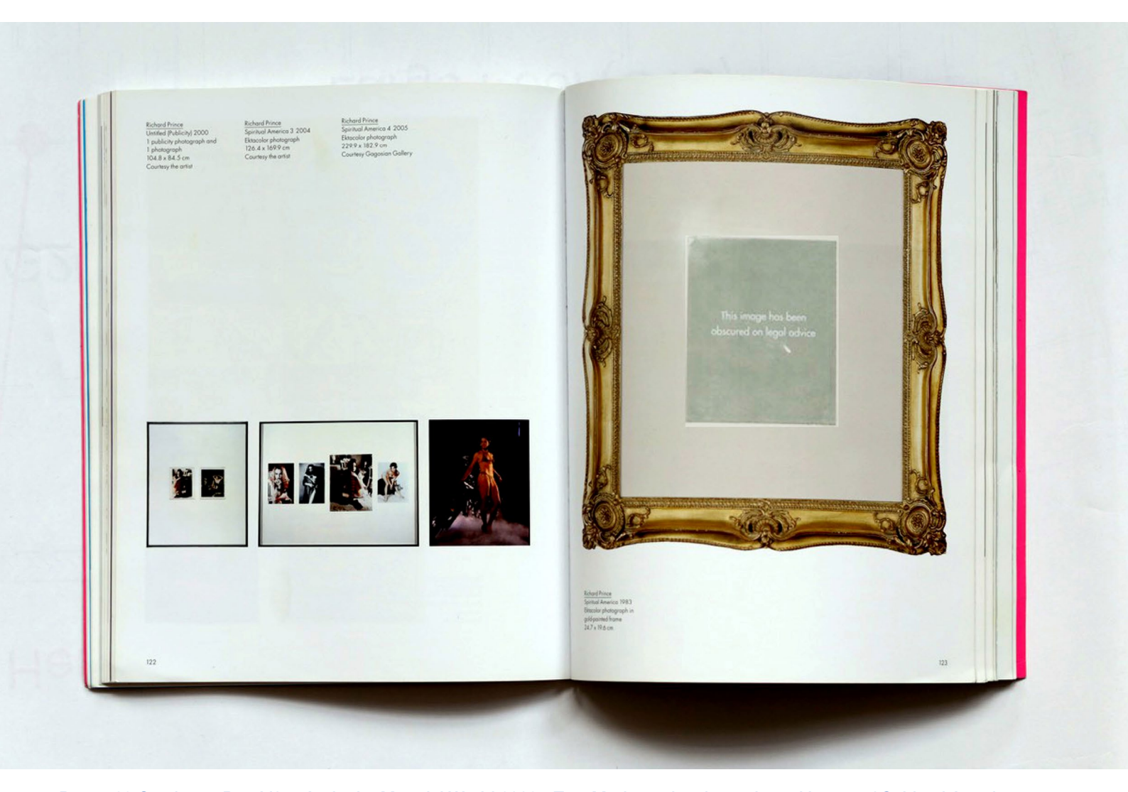
Page 123 Catalogue Pop Life - Art in the Material World 2009 - Tate Modern, showing redacted image of Spiritual America.