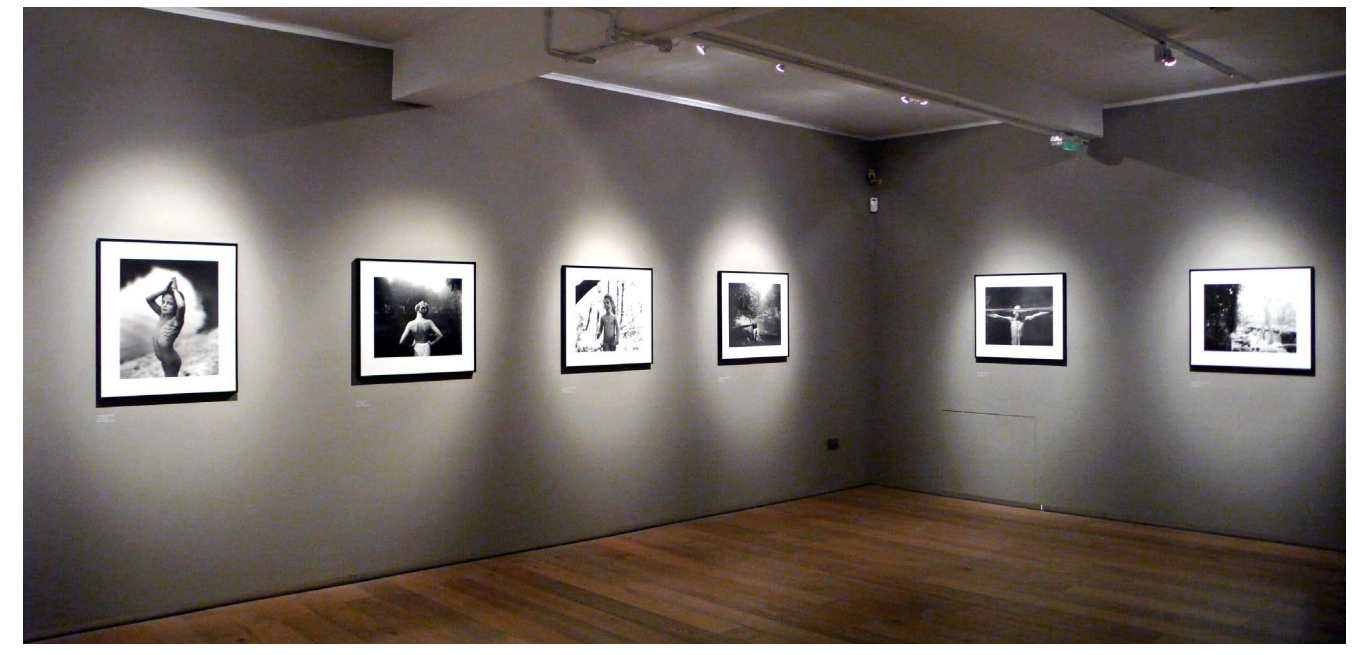
Installation image of Sally Mann: The Family and The Land at The Photographers' Gallery at 16-18 Ramillies Street (7th June - 18th September 2010).