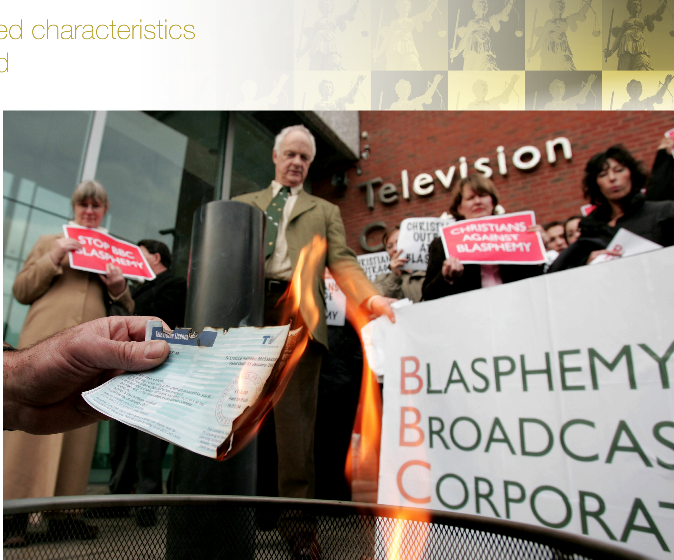
Members of Christian organisations burn TV licences during a demonstration outside BBC Television Centre in London.

The Equality Act 2010 has been described as harmonising or consolidating legislation by bringing together statutory protections against discrimination of different kinds of under multiple acts and statutory instruments. It prohibits discrimination on the grounds of one or more "protected characteristics". These are age, disability, gender reassignment, marriage and civil partnership, pregnancy and maternity, race, religion or belief, sex and sexual orientation.