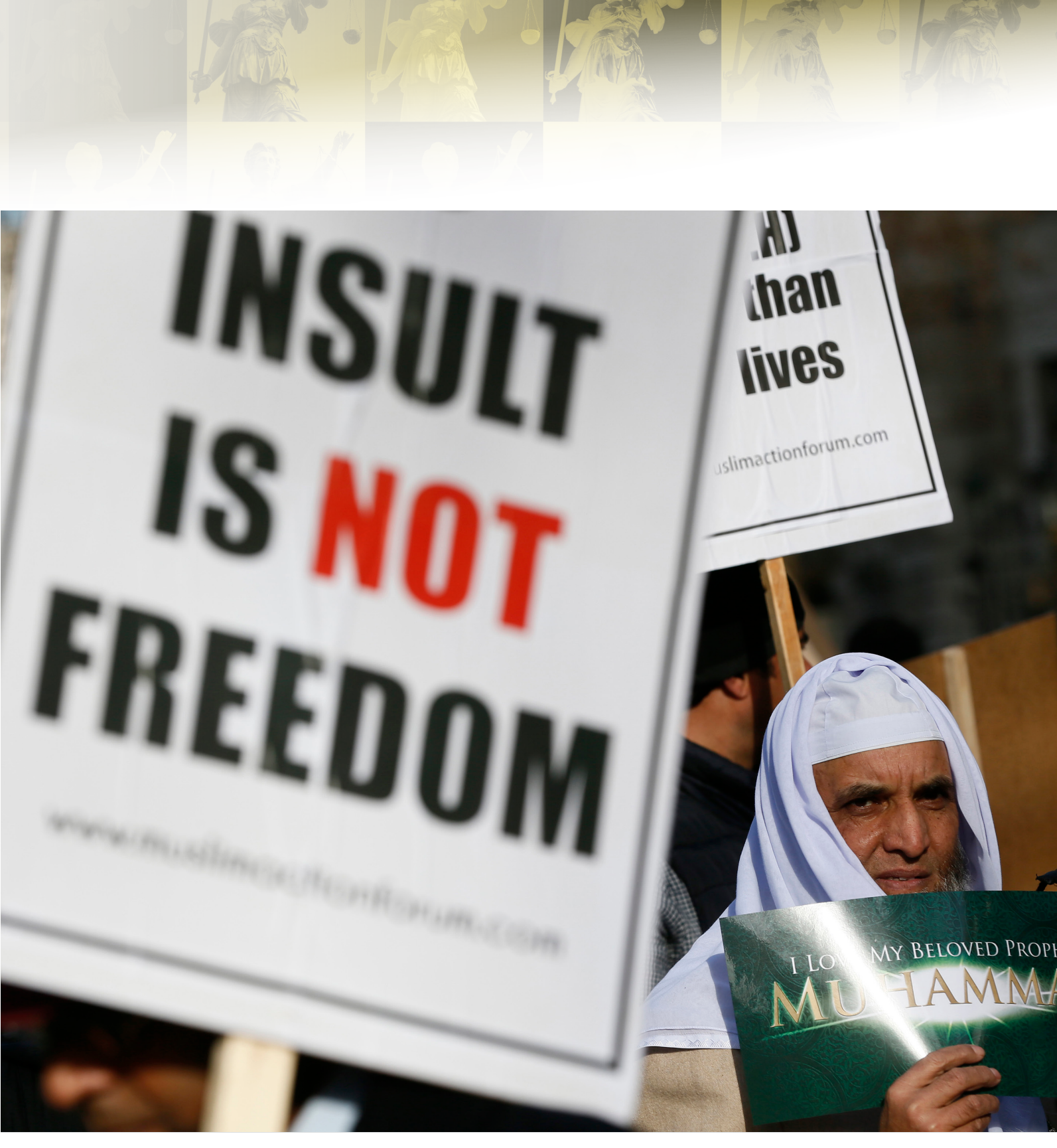
Muslim demonstrators hold placards during a protest against the publication of cartoons depicting the Prophet Mohammad in Charlie Hebdo, near Downing Street.

A. The right to freedom of expression is protected in the European Convention on Human Rights and by UK case law. The right to free assembly is protected as an aspect of this right. Both rights carry great weight, neither automatically outweighs the other and are both qualified rights. This means they may be subject to reasonable